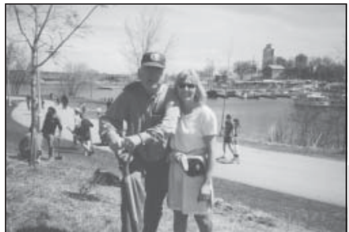
Two participants take a well-deserved break during the Earth Day tree planting at Bayfront Park.

BARC's aim is to be a credible, competent, authoritative and well-balanced voice, speaking out on behalf of the bay.