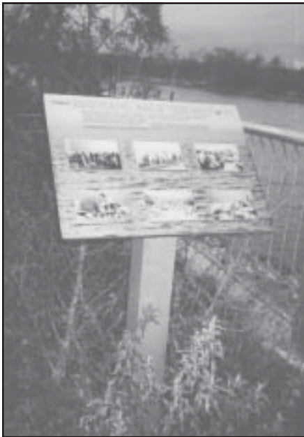
The volunteer's role in the in the creation of the Waterfront Trail is recognized in BARC's traiside interpretive sign.

BARC has strong links to the Hamilton Harbour RAP process through membership on the Bay Area Implementation Team (BAIT), the RAP Forum, the Randle Reef Project Advisory Group and several steering committees. BARC supports the principles, goals and objectives set out by the RAP through letters, presentations and meetings to local politicians, senior levels of government and the International Joint Commission.