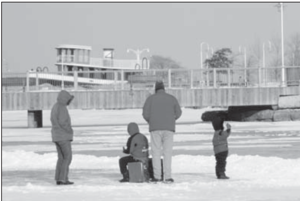
Bay Area parks provide year-round access to the harbour waterfront.

Phone: (905) 527-7111 Fax: (905) 522-6066 E-mail: barc@hamiltonharbour.ca Internet: www.hamiltonharbour.ca