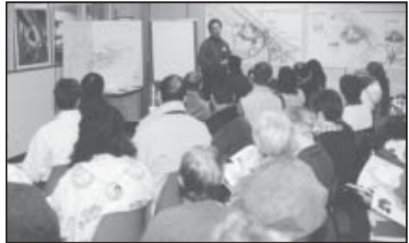
Comments on habitat restoration were received at BARC's Community Workshop.

BARC's Annual Implementation Award was presented to McMaster University for its immense contributions and research activities on the Hamilton Harbour and Cootes Paradise marsh restoration projects. McMaster also generously provides BARC with office and resource library space in the Life Science Building.