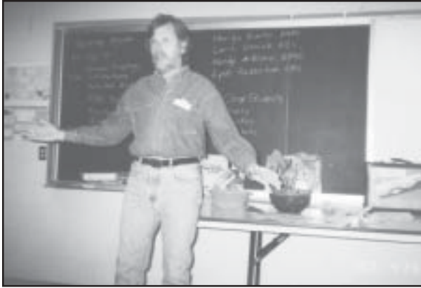
The Mini Marsh program promotes wetland ecology in the classroom.